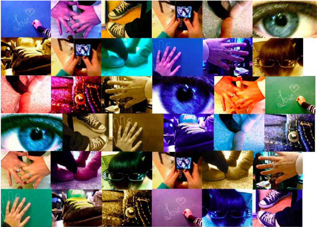
boom/boom/pow! a collaborative self- and group- portrait done in words & images by 21 9th and 10th grade students at The Wheatley School *